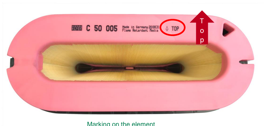
Marking on the element