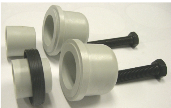
Without oil seal