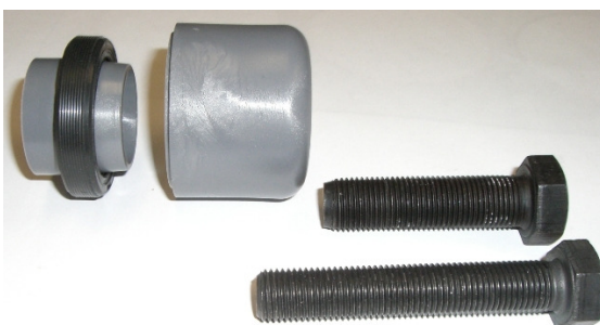
Without oil seal