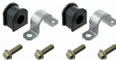
repair kit SWAG 50 92 7400

So you have everything you need to fit stabilizer mounts quickly!